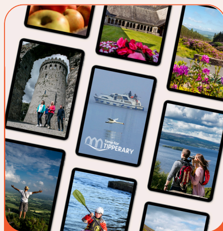
Inside the Asset Bank: photos, videos, e-brochures, insight reports, Time for Tipperary brand kit, and more

As a member, you have free access to the Time for Tipperary Digital Asset Bank , a shared resource designed to support your marketing. It includes high-quality images and video, e-brochures, research and insight reports, and the Time for Tipperary logo and brand kit — making it easier to promote your business professionally while aligning with the wider destination brand.